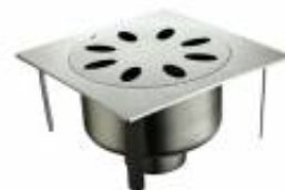
PZCSQR13030006 Drain floor trap SQUARE serie 30 cm