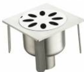
PZCSQR10020006 Drain floor trap SQUARE serie 20 cm