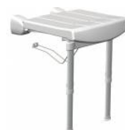
SDLSO03435201 Soft polypropylene lift up seat with legs SOFT series