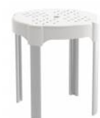
SDLRA02003801 Polypropylene seat RAZOR series