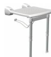
SDLRA03424701 Polypropylene lift up seat with legs RAZOR series