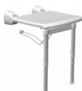
SDLRA03424701 Polypropylene lift up seat with legs RAZOR series