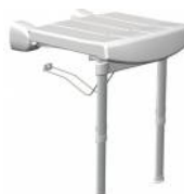
SDLSO03435201 Soft polypropylene lift up seat with legs SOFT series