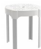
SDLRA02003801 Polypropylene seat RAZOR series