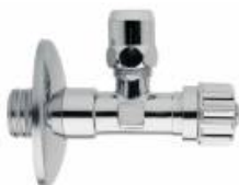
MSCPRTAB0105 Angle valve with biconical washer PORT ECO series