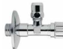
MSCPRTAB00105 Angle valve with biconical washer PORT series