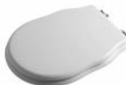
SWCBOHOT02001 White polypropylene WC seat BOHEME series