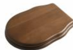
SWCBOHOT06000 Walnut polypropylene WC seat BOHEME series