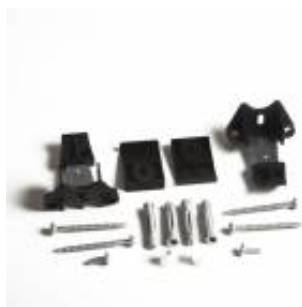
ACSFIX05F0005 Fast fixing