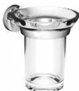
BTACOC0210205 ABS chromed tumbler holder COCO' series