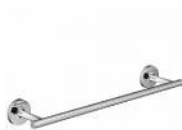
BTACOC0600205 ABS chromed towel bar COCO' series