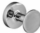
BTACOC0400205 ABS chromed robe hook COCO' series