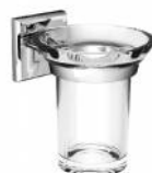
BTAMIA0210205 ABS chrome plated tumbler holder MIA series