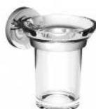
BTALUC0210205 ABS chrome plated tumbler holder LUCE series