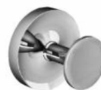
BTALUC0400205 ABS chrome plated robe hook LUCE series