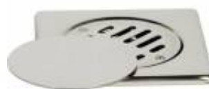
CPRSQR0210005 Floor drain fixed grid and movable cover SQUADRA series