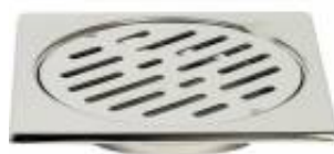
CPRSQR0110005 Floor drain fixed grid SQUADRA series