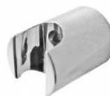
SPPRNFIX00105 Brass fix shower bracket ROUND series