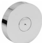
BDJLKF0650105 Brass body jet LOOK series