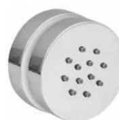
BDJEVO0650105 Brass adjustable body jet EVO series