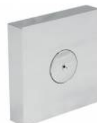
BDJKAF6565105 Brass body jet KALIPSO series