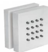
BDJLOP6565105 Brass adjustable body jet LOYAL series