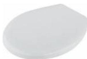
SWCHEH0000101 Universal duroplast WC seat HOLLAND ECO series